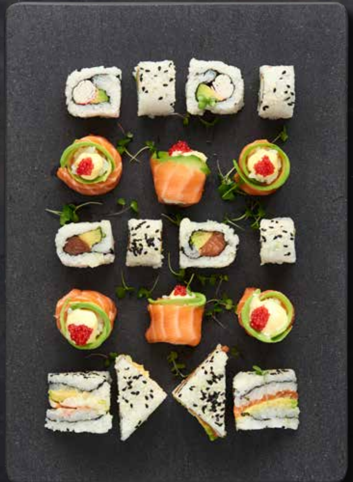
St Helena Bay 338 2 Salmon fashion sandwiches 2 Prawn fashion sandwiches 6 Salmon roses 4 Spicy tuna & avocado inside-out rolls 4 California rolls