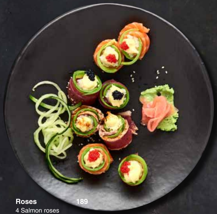
Roses 189 4 Salmon roses 2 Tuna roses 2 Seared tuna roses