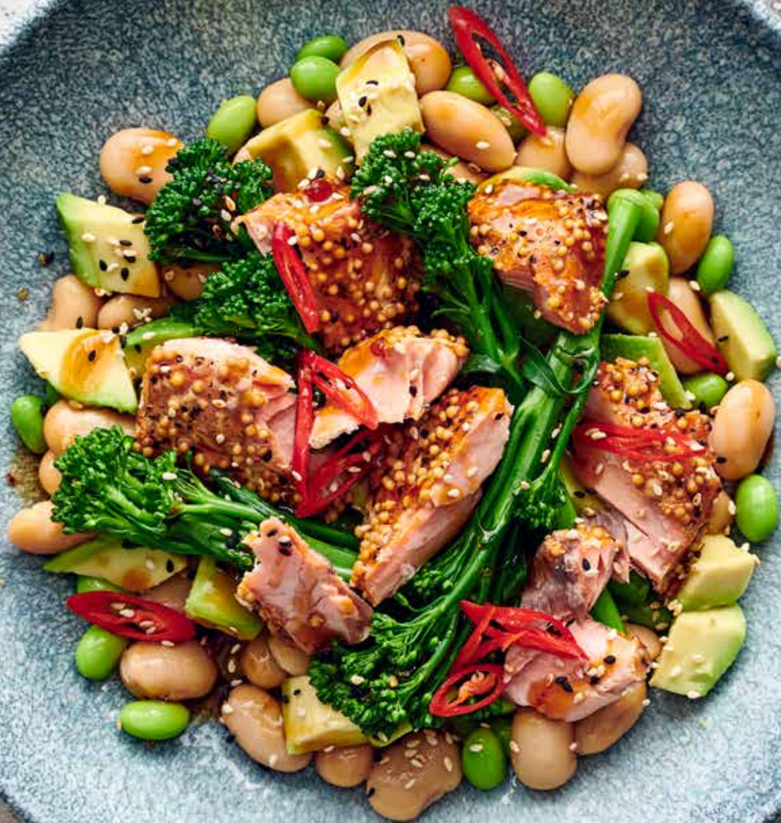
Smoked Salmon Trout