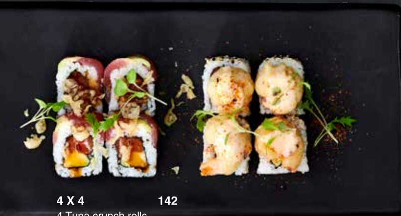
4 X 4 142 4 Tuna crunch rolls 4 Rock shrimp rolls with smoked salmon and cream cheese