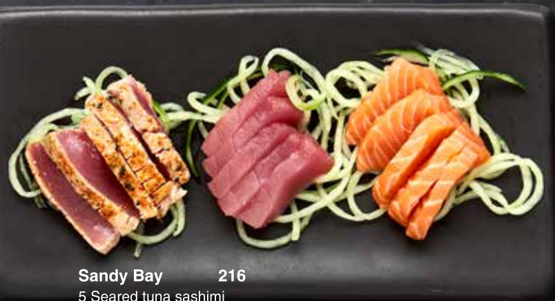
Sandy Bay 216 5 Seared tuna sashimi 5 Tuna sashimi 5 Salmon sashimi